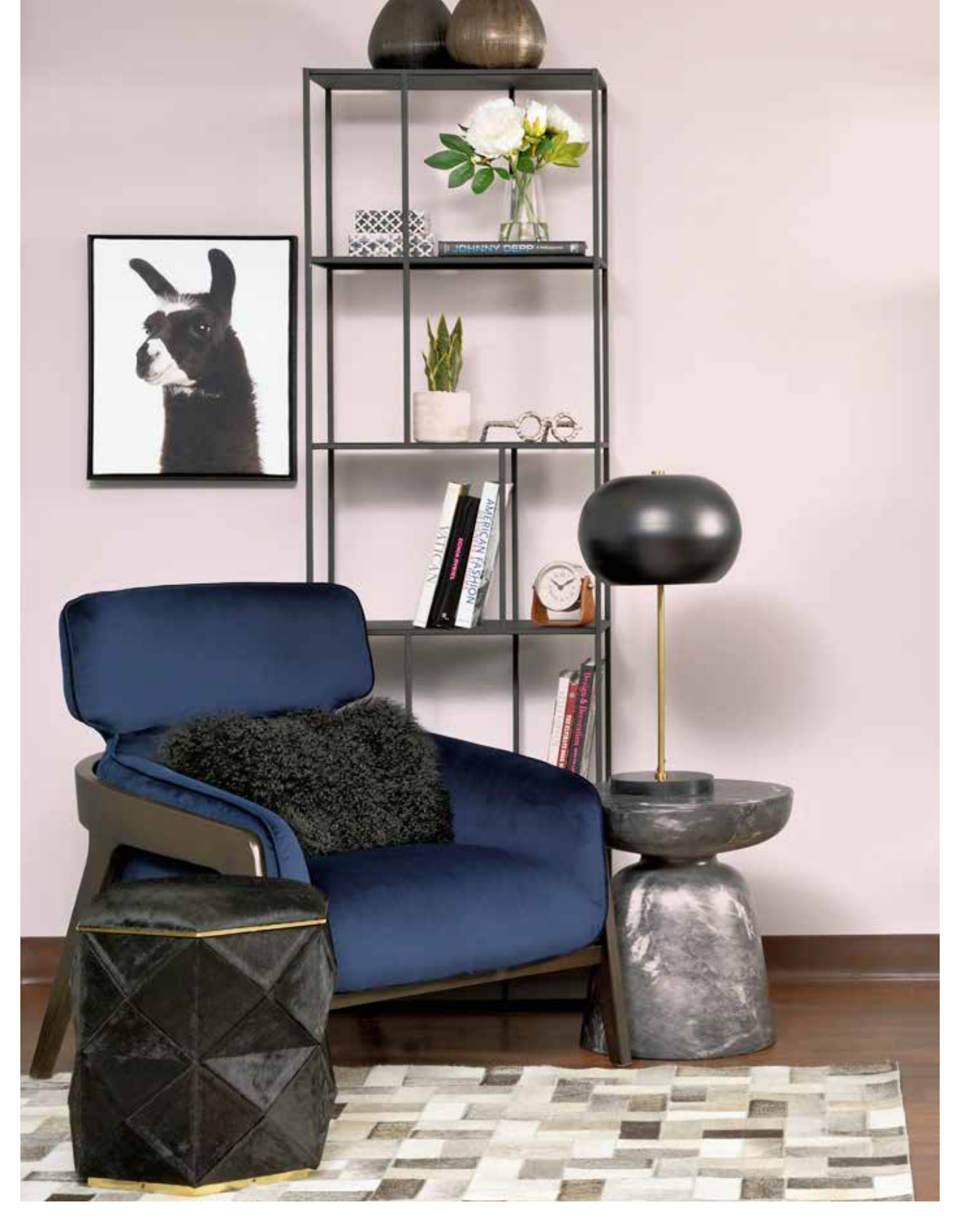
EVELYN'S DOUBLE TAKE